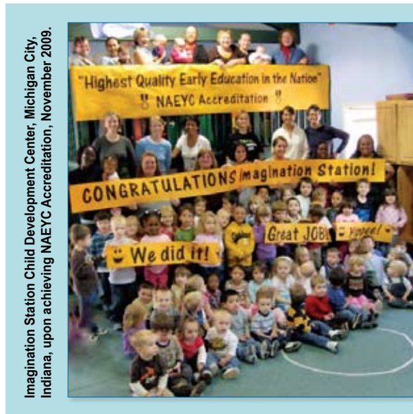
Imagination Station Child Development Center, Michigan City, Indiana, upon achieving NAEYC Accreditation, November 2009.

NAEYC developed its accreditation system in the early 1980s, in response to concerns about the growing number of children attending child care and preschool programs and the lack of consensus as to what constituted quality in such programs. Today the system is widely recognized as the gold standard for excellence in early childhood education. To celebrate our 25th anniversary, we present a timeline of milestones in NAEYC Accreditation.