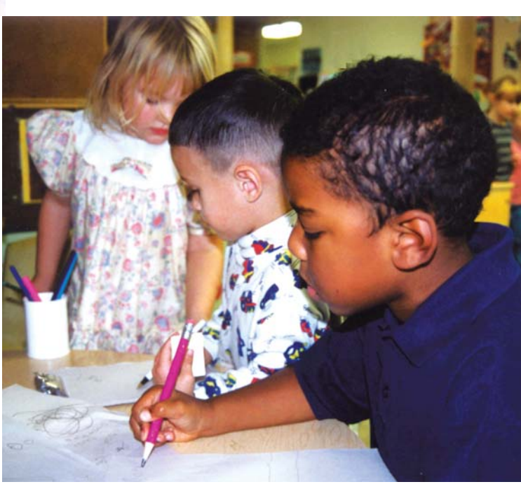
Step 2: Conversations and writing a plan

Formal meetings, built into the daily classroom routine, are ideal times for children, teachers, and family volunteers to have large group conversations about forming and writing a plan. In these routine meetings, children already know what to expect; they understand the process as well as the expectations. Our class meetings generally include a variety of fairly predictable experiences (reading stories, singing songs, conversations). Depending on the time of the meeting, we always discuss what has happened earlier or what is about to happen. While one teacher facilitates this meeting, another adult (teaching assistant or parent) writes down ideas, questions, and thoughts about the conversations. The adults later review this documentation to help plan and provide appropriate experiences.