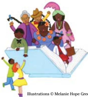
Illustrations © Melanie Hope Greenberg