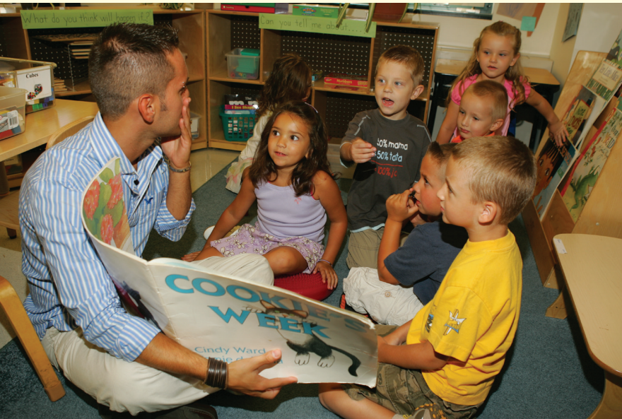
Richard Graessle © NAEYC

little evidence that calendar activities that mark extended periods of time (a month, a week) are meaningful for children below first grade (Friedman 2000). However, there are some temporal concepts that preschoolers can grasp in the context of their daily activities—concepts such as later , before , and after .